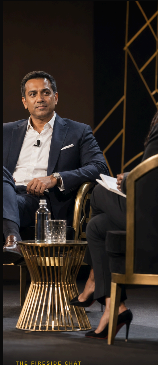
THE FIRESIDE CHAT